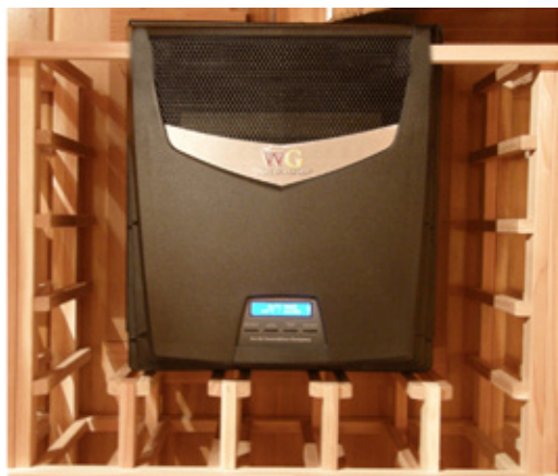
Front View in Racking