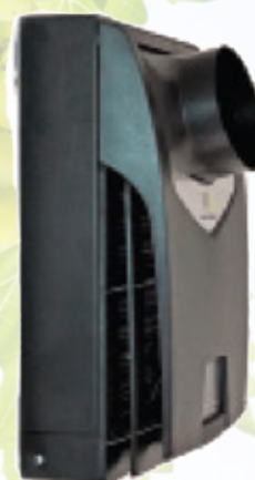
Back View With Optional Duct Adapter