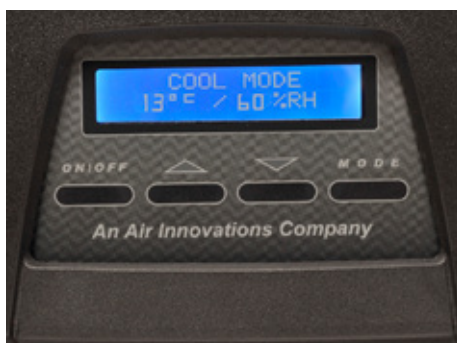
Front Digital Display