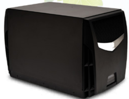
TTW unit out of racking